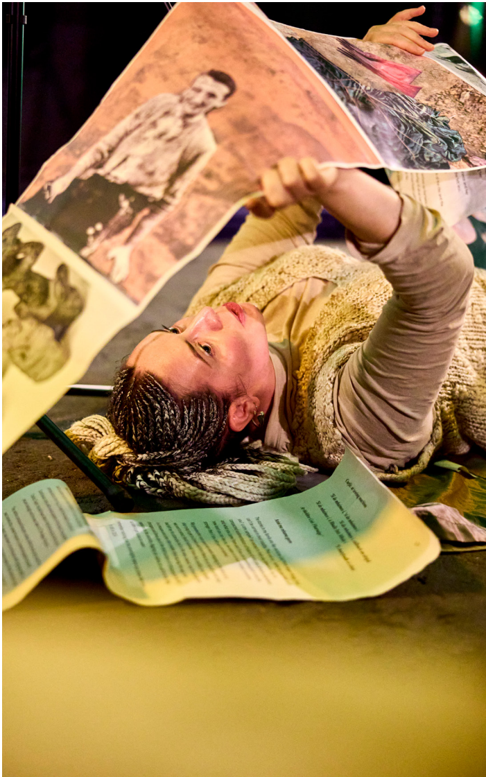
PHOTO: ALICE REKAB LEGACY MATERIALS PERFORMANCE DOCUMENTATION COURTESY OF THE ARTIST AND BRENNIA HORRAX