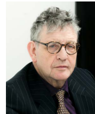
Paul Muldoon Tuesday 20 August 6pm – 7pm EFI Spiegeltent