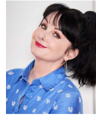
Marian Keyes Thursday 15 August 5pm – 6pm EFI Venue T