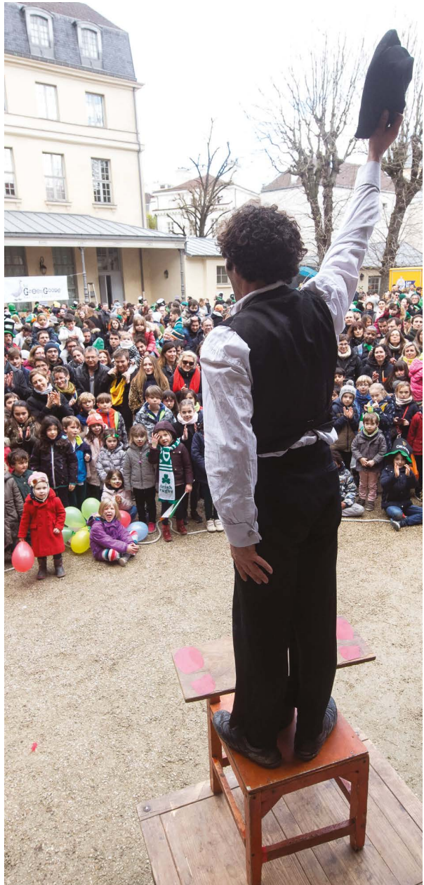
Saint Patrick's Day.

In the Autumn, two jazz concerts are presented at the JazzColors festival at the Hungarian Institute.