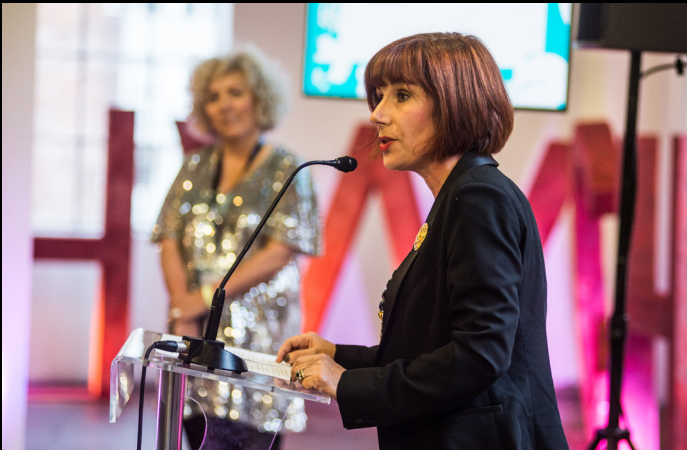
MINISTER JOSEPHA MADIGAN SPEAKING AT THE OPENING OF HARD WORKING CLASS HEROES

In 2018, Culture Ireland supported 186 international delegates from 28 countries to come to Ireland to attend 16 Festivals.