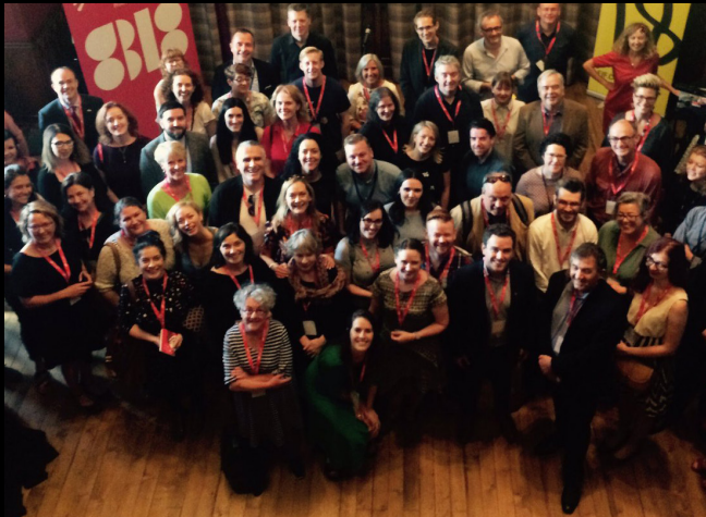
CULTURE IRELAND EDINBURGH SHOWCASE NETWORKING EVENT 2018

During 2018, Culture Ireland supported 24 Showcase events across artforms in 8 different territories. In all, 91 artists/companies were supported to present their work in a Showcase context.