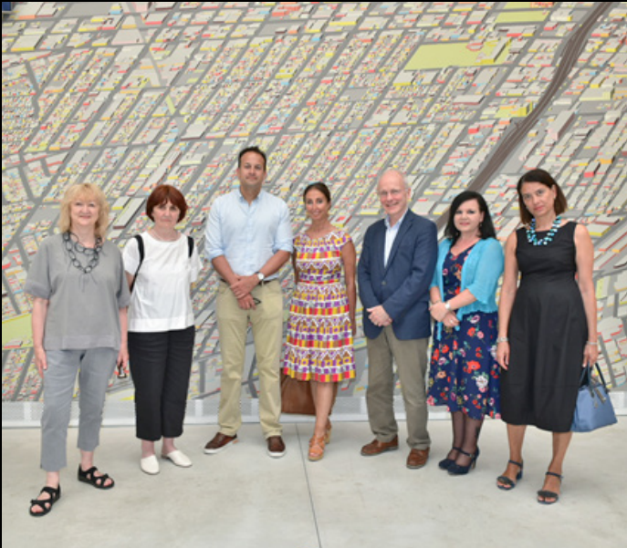
AN TAOISEACH, LEO VARADKAR T.D. VISITING THE VENICE ARCHITECTURE BIENNALE EARLIER THIS YEAR

In 2018, making history as the first Irish architects ever to curate the Venice Architecture Biennale, Yvonne Farrell and Shelley McNamara of Grafton Architects following a list of high profile global architects to be awarded this honour.