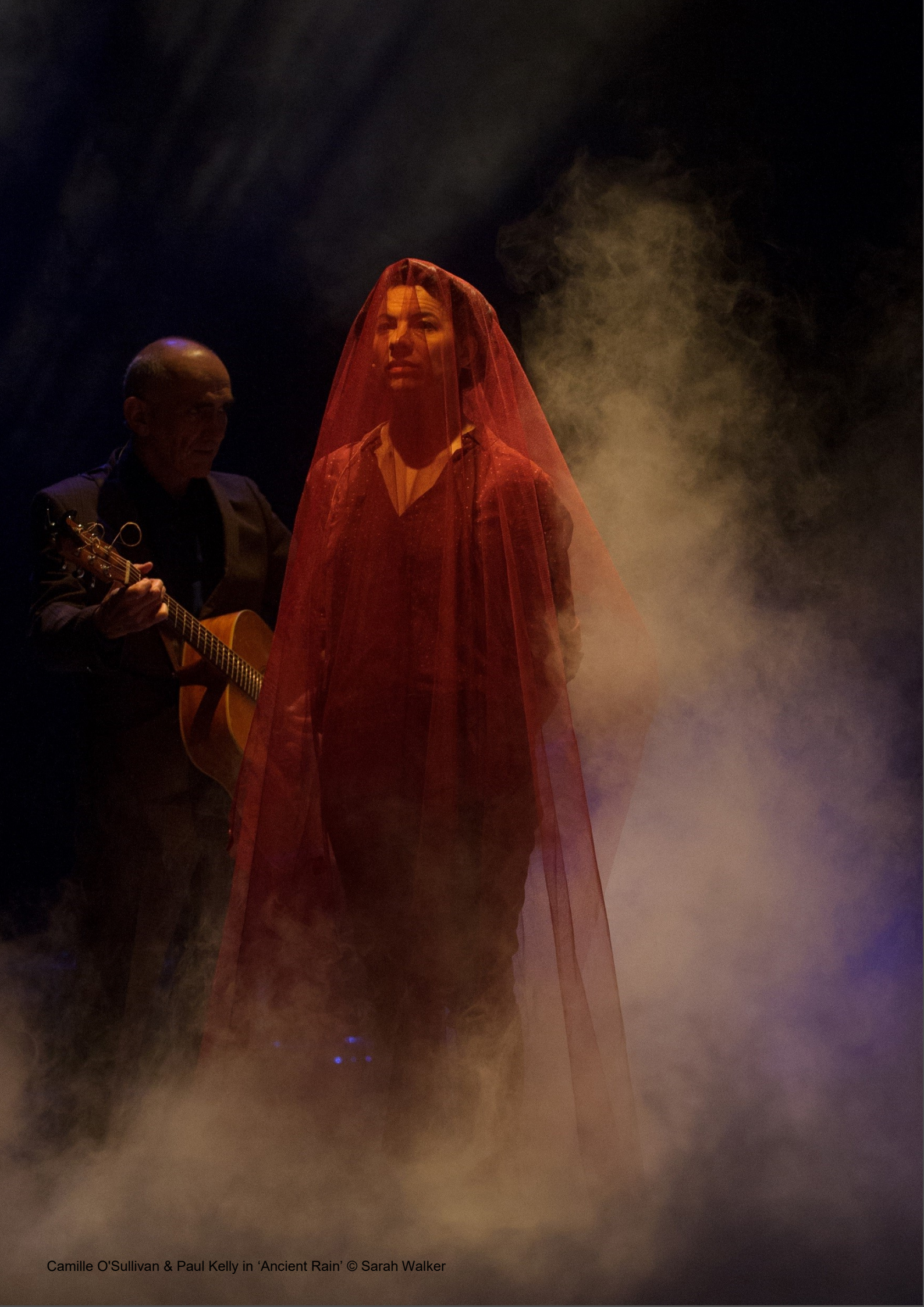
Camille O'Sullivan & Paul Kelly in 'Ancient Rain'