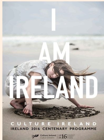
For further information, please visit www.cultureireland.ie/iamireland