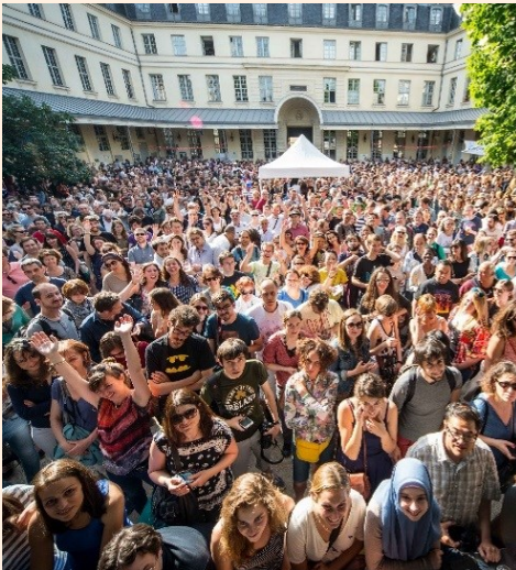
Fête de la Musique '15 at the Centre Culturel Irlandais Paris

A special acknowledgment is due to our partners Irish Film Institute International, Ireland Literature Exchange and First Music Contact who have ensured Irish film, literature and new Irish bands reached all corners of the globe in 2015, and to the Centre Culturel Irlandais Paris and New York Irish Arts Center for their continuing excellent programming and facilitation of our artists.