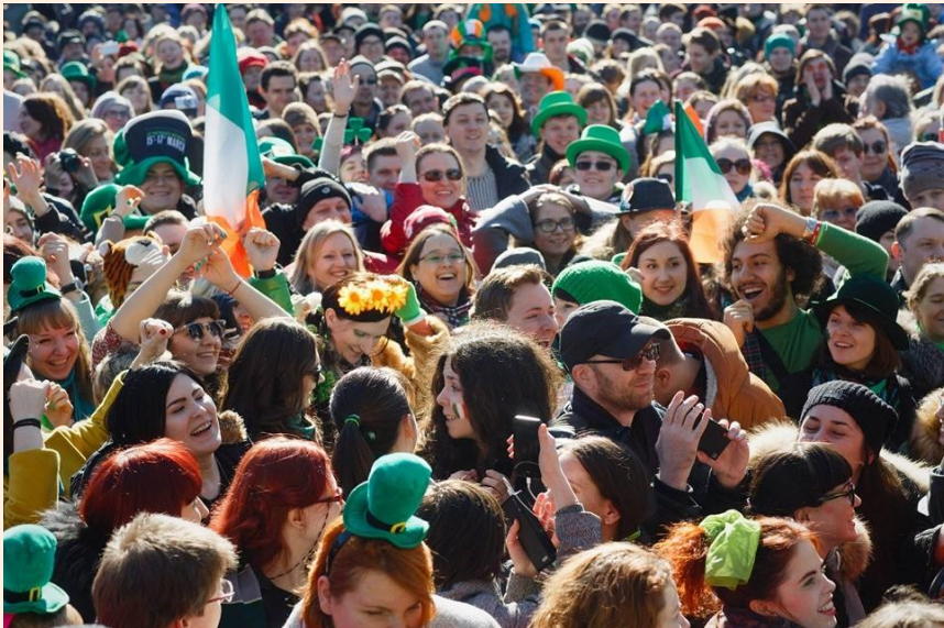
St Patrick's Day, Moscow 2015

across 22 countries from Australia and New Zealand to China, the United States, Mexico, Russia and across Europe, Ireland's world class artists and musicians lit up many stages, venues and festivals.