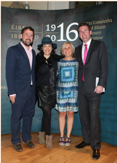
Launch of 'I am Ireland' Programme October 2015

We look forward to presenting I am Ireland , Culture Ireland's contribution to the Ireland 2016 Centenary Programme. The year-long calendar of activity forms part of the Government's Global and Diaspora Centenary Programme and was launched in Smock Alley Theatre in October 2015.