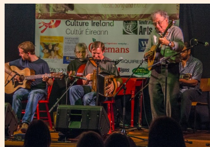
Feile Seamus Creagh 2015