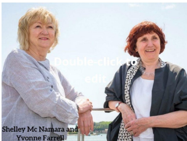
Shelley Mc Namara and Yvonne Farrell

Grafton Architects won the Pritzker Architecture Prize which is presented annually, to honour a living architect or architects whose work demonstrates a combination of those qualities of talent, vision, and commitment, which has produced consistent and significant contributions to humanity and the built environment through the art of architecture.